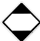
Limited Quantity Ground